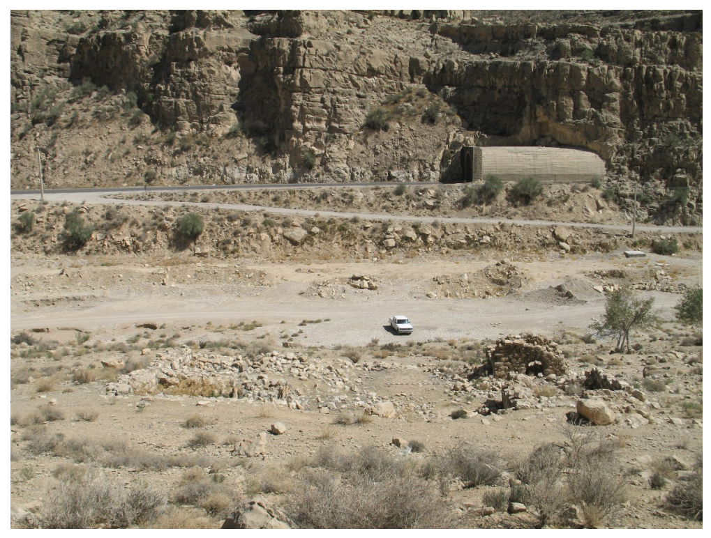
Figure 11. Caravanserai, D. Rossi.

height is 40 centimeters. Nevertheless, the remains of the two southern spaces are preserved (Fig. 11).