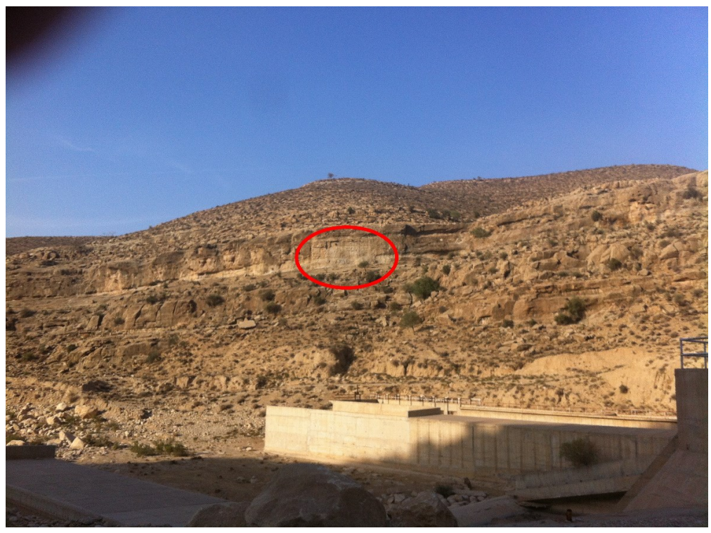
Figure 4. Rock relief seen from the gorge; imagine modified, D. Rossi.