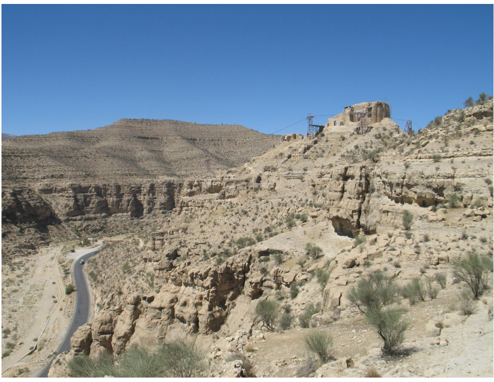
Figure 7. Qal'a-ye Dokhtar fortress, D. Rossi.