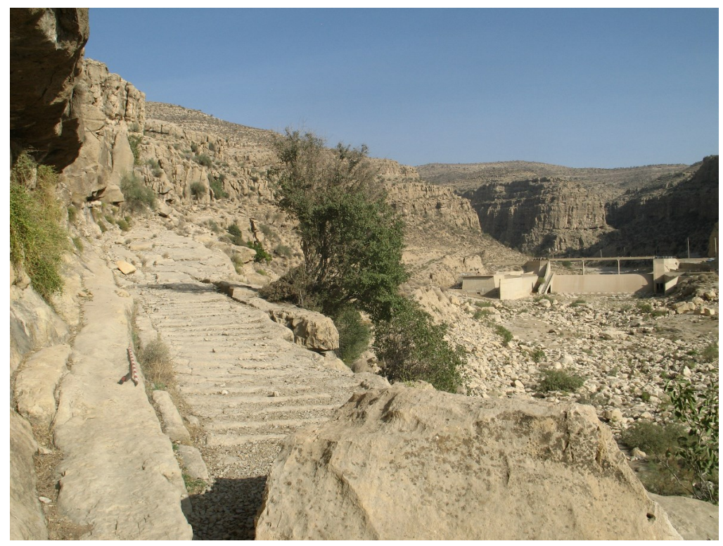
Figure 3. Road partly carved in the rock, D. Rossi.

When the city was completed, the ideological value it had for its founder emerged: with its circular layout, it embodied a vision of the ideal State, in which the figure of the sovereign is central and the other social classes orbit around him. As it turned out, this new vision would end up successfully supplanting the Arsacid's semi-feudal system (Huff 2010: 52–53).