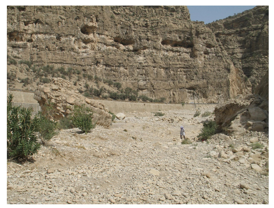
Figure 9. Ruins of the bridge, D. Rossi.

guards the narrow gorge from above, testifying the key role of the serpentine path formed by the river (Figs. 7-8).