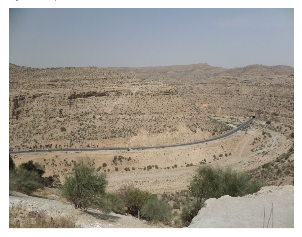
Figure 8. The gorge seen from the fortress cliff, D. Rossi.

The fortress called Qal'a-ye Dokhtar (Huff 1971: 127–171; Huff 1974: 156–158) – literally, the Castle of the Girl – was built by Ardašīr upon the heights of the Kūh-e Tang-āb, literally 'the Mountain of the Tang-āb', to defend himself from the attacks of enemies, who were tempted by the central authority. The fortress