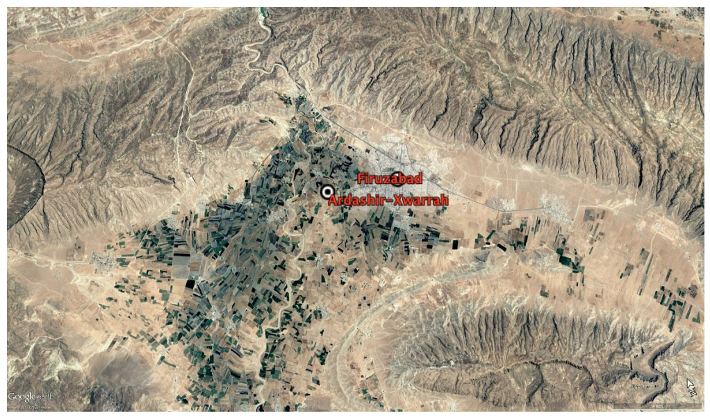
Figure 2. The plain of Ardašīr-Xwarrah; image modified from Google Earth©. Credits: Google, DigitalGlobe©.

However the practical and strategic value are not enough; indeed, the migration routes of Qashqaii nomads nowadays prove that the mountains are not as insurmountable. Several historical Islamic sources reported the plain as a 'lake'. For example, ibn-Hawkal ( Kitāb al-masālik wa'l-mamālik ) wrote that: