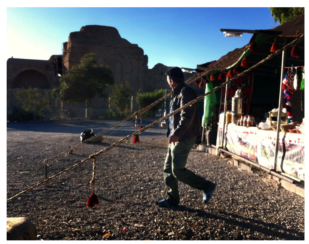
Figure 14. Qashqaii's tent near the palace of Ardašīr located in the plain, D. Rossi.