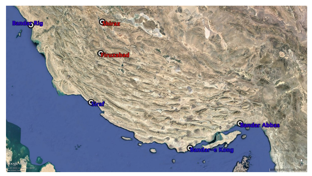
Figure 12. Three harbors; image modified from Google Earth©. Credits: Google, DigitalGlobe©.

In 1660, the monk Raphael du Mans, reported the existence of three different Persian harbors: Bender Kommeron, now Bender Abass, Bender Congo, now Bander-e Kong, and Bender Rig (Du Mans 1890: 5–9); (Fig.12) while at the end of the eighteenth century, the British East India Company established a trading station in the harbor of Bushire, making it become their headquarters (Beck 1986: 87).