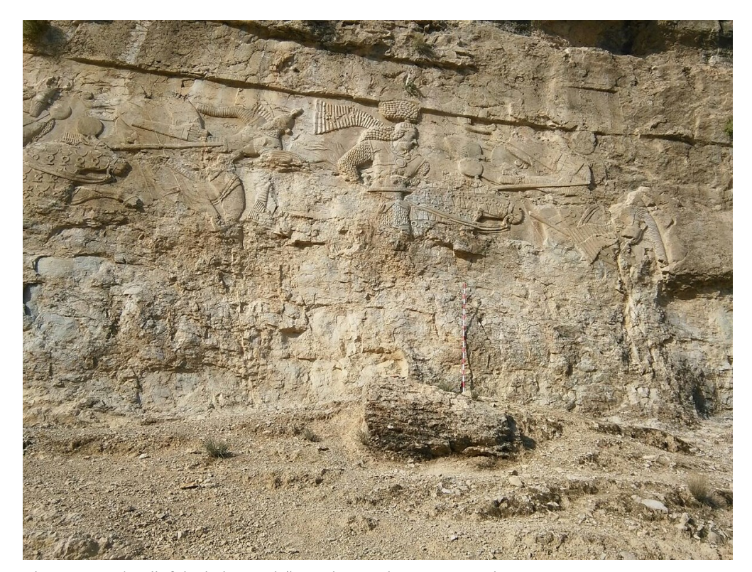
Figure 5. Rock relief depicting Ardašīr against Ardavān, D. Rossi.

Most of the Sasanian artistic production may be inserted in a context of royal propaganda; actually, the dynastic program used the most perceptible and decisive medium: the image. The rock reliefs assumed the role of expression and paradigm of the political concepts (Harper 1986: 585–594). Hence, during Ardašīr's reign,