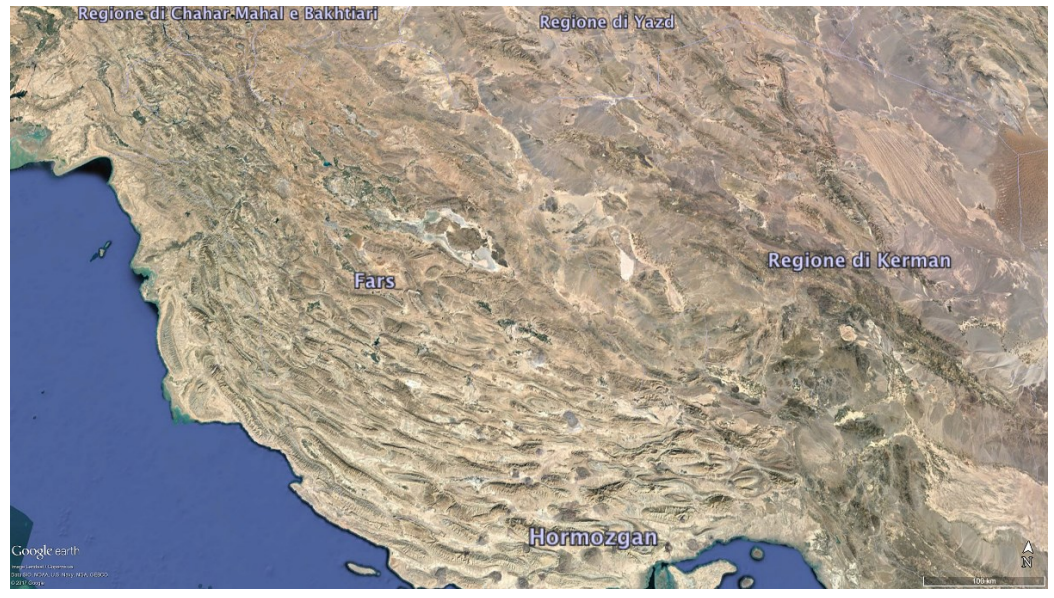
Figure 1. Fārs district; image modified from Google Earth©. Credits: Google, DigitalGlobe©.

In first instance, it will be analyzed the symbolic and strategic role carried out by the foundation of the Sasanian city of Ardašīr-Xwarrah in a plain accessible from the northern path. Then it will be described the market exchanges during the Islamic era mainly under the Buyid dynasty, a