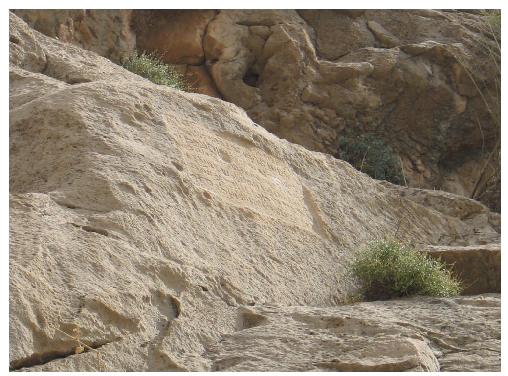
Figure 10. Inscriptions of Mihr-Narseh

The Muslim author al-Balādhurī reports that during the Arab-Muslim conquest of Irān (CE 650) Eṣṭaxr and Ardašīr-Xwarrah were the last cities of Fārs to fall, under the attacks of the general 'Abd Allāh ibn 'Āmir (Lokhart 1991: 925). Despite the fact that the last Sasanian king escaped to Merv, abandoning his homeland to the new power and the new religion, the place where the dynasty was born tried to resist, in vain.