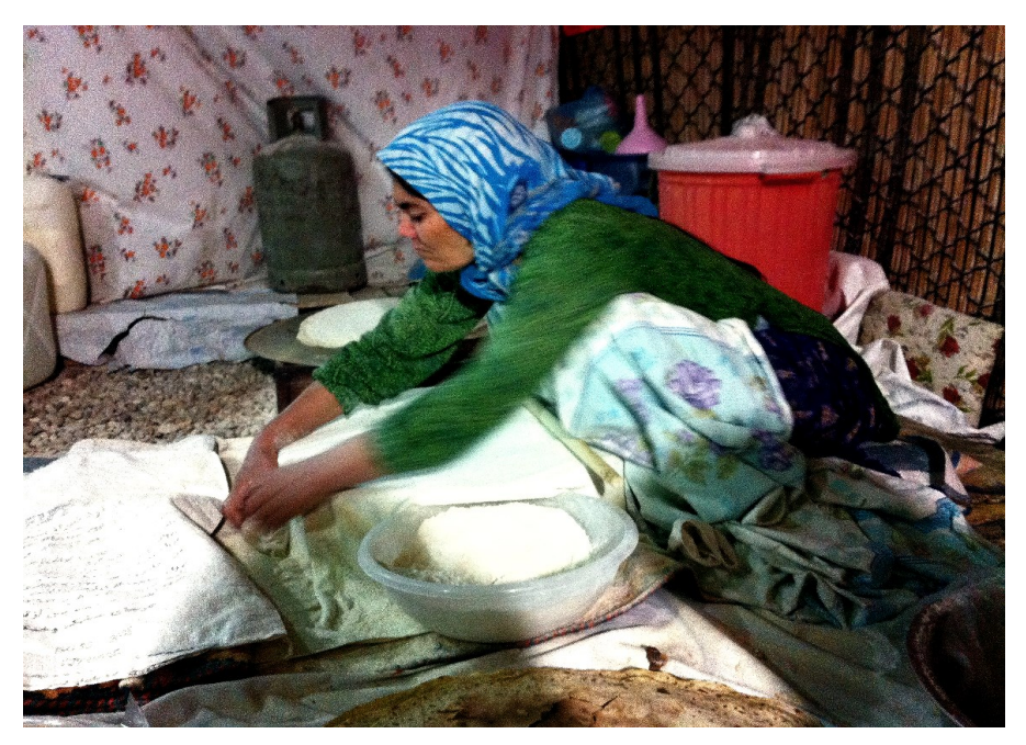
Figure 13. Qashqaii woman preparing naan bread, D. Rossi.

In fact, Fīrūzābād has been not only an economic centre as a marketplace, but also an ideological centre of their domains, a fixed point in their wondering life (Alizadeh 1988: 33). Indeed, nowadays Fīrūzābād is the place where the last Qashqaii still live (Fig. 13-14).