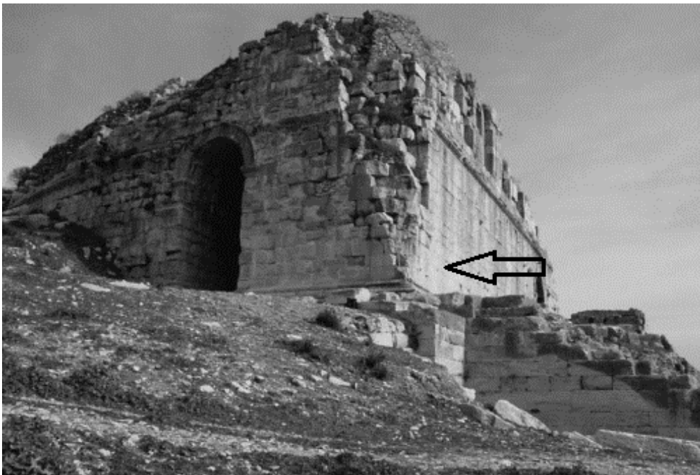
Figure 2. Location of the inscription in the Theatre structure (after Cline 2011).

Additionally, the location of this inscription is of great interest. Recent research indicates that the centre of the city, where the theatre is located, was inhabited at least well into the sixth century, and that during this time some buildings were kept and maintained, while new ones were built, including churches (Cline 2011: 76). Therefore not only would this invocation have been displayed in a very public place (fig.2), and in the vicinity of churches, but it lasted for several centuries even after Christianity won hegemony. Unorthodox imagery prominently displayed, as in this case, in public or private buildings indicates that these images transmitted meanings that were important for the people, and which they could not find among motifs in their own specific affiliations (Hezser 2005a: 283). This shows that this inscription enjoyed public acceptance, and that the use of symbols and ritual formulae from different religions for a specific practical purpose was considered normal in this context. On the other hand, while the task of ascribing a religious identity seems impossible, the range of questions to be asked is much bigger than the narrower limit of the religious tag. Public displays of unorthodox imagery such as the ‘archangel inscription’ can be considered as evidence of coexistence, even acceptance, of different religious concepts and communities.